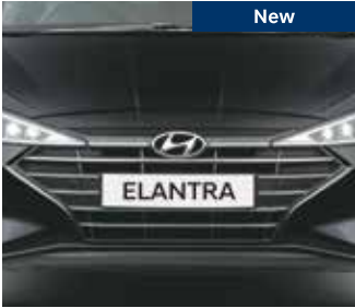
Dominant front grille design