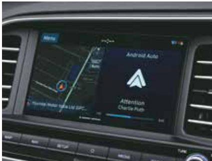
20.32cm (8") HD smart touchscreen infotainment with navigation & Blue Link