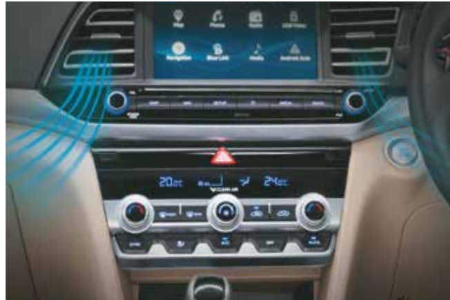
Dual zone FATC with cluster ionizer