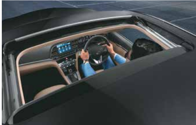
Smart electric sunroof

The new Elantra has everything it takes to delight you. It hosts a world of innovative features that have been designed keeping your convenience and comfort in mind. The result is an unforgettable driving experience that only a few deserve.