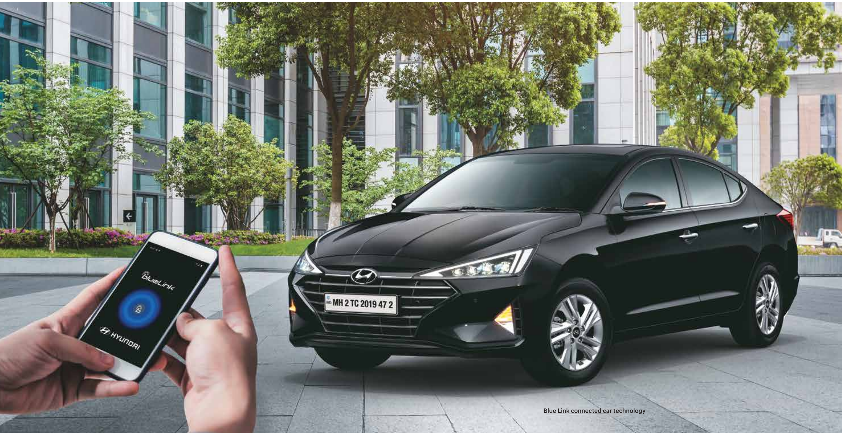
Blue Link connected car technology