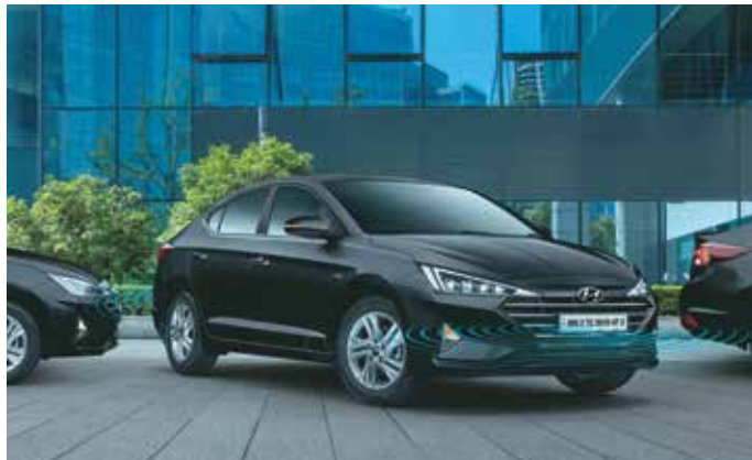
Front & rear parking sensors with rear camera