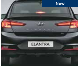
Sporty two tone rear bumper

Other features: Shark fin antenna | New front bumper design