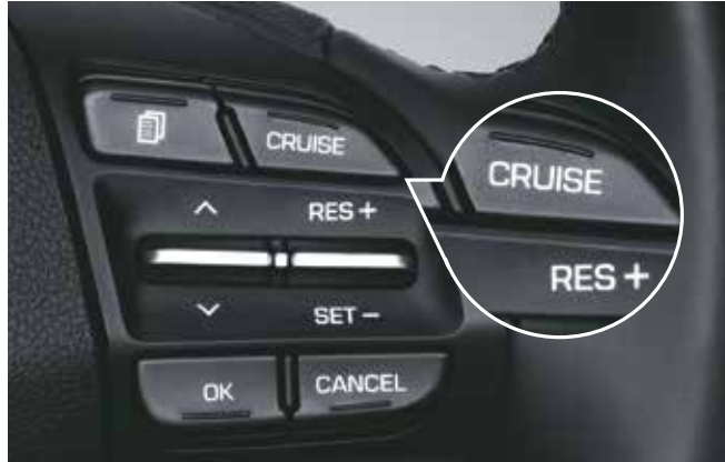
Auto cruise control