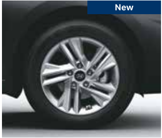
Stylish R16 (D= 405.6mm) alloy wheels