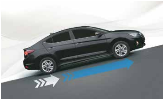
Hill assist control

Other features: Burglar alarm | Speed sensing auto door lock | Strong body structure with AHSS | Electronic stability control (ESC)