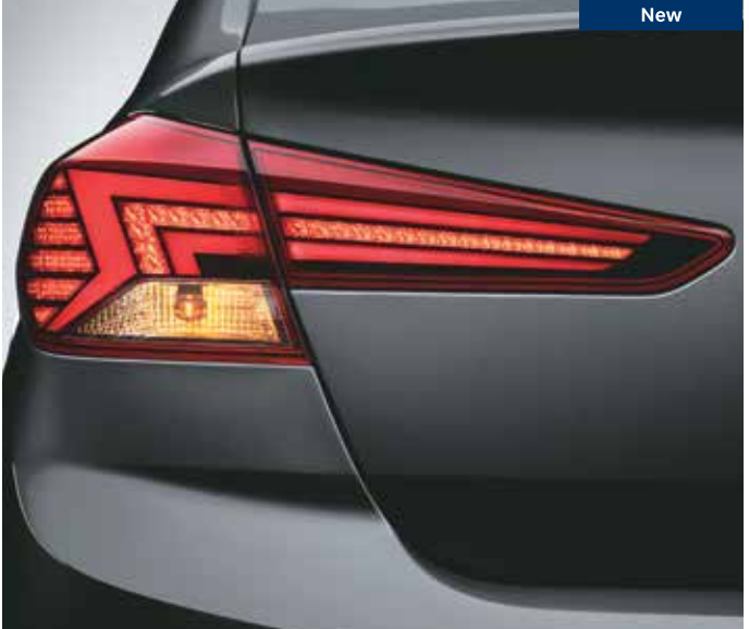
Sporty rear combination LED tail lamps