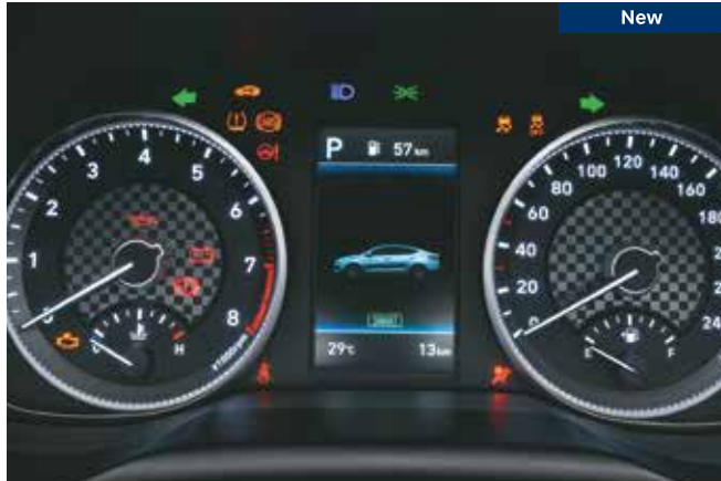
Instrument cluster with coloured multi information display

Taking a seat in the new ELANTRA is like entering a world of opulence that has been created exclusively for you. It boasts of a driver-centric ergonomic design and many new additions, the centre fascia being one of them. Simply put, it is a treat to watch, to own and to drive.