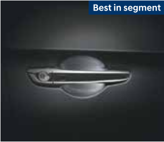
Chrome door handles with pocket light