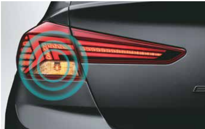
Emergency stop signal