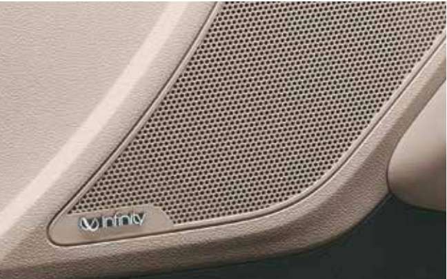
Premium Infinity sound system with door speakers, centre speaker, tweeters, amplifier, sub-woofer