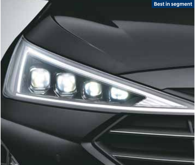
Dynamic LED quad projector headlamps with LED DRLs

Open your world to the sportier, grander and irresistible new Elantra. Retaining the classiness of the fluidic sculpture 2.0 design, it comes with premium additions that make it a stunner in every sense of the word. With dominant new front grille, dynamic headlamps and tail lamps, coupe-like roofline, the new Elantra is perfect for conquering the roads.