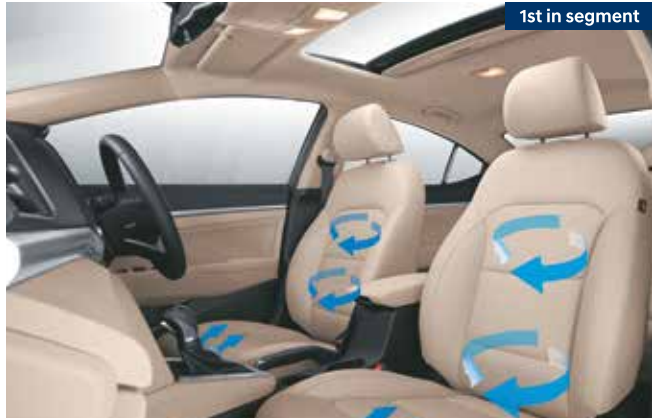
Front ventilated seats