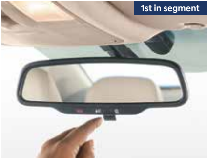
IRVM with Blue Link