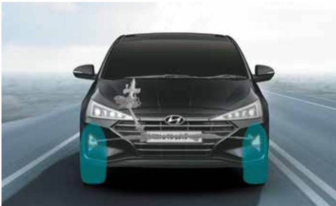
Vehicle stability management