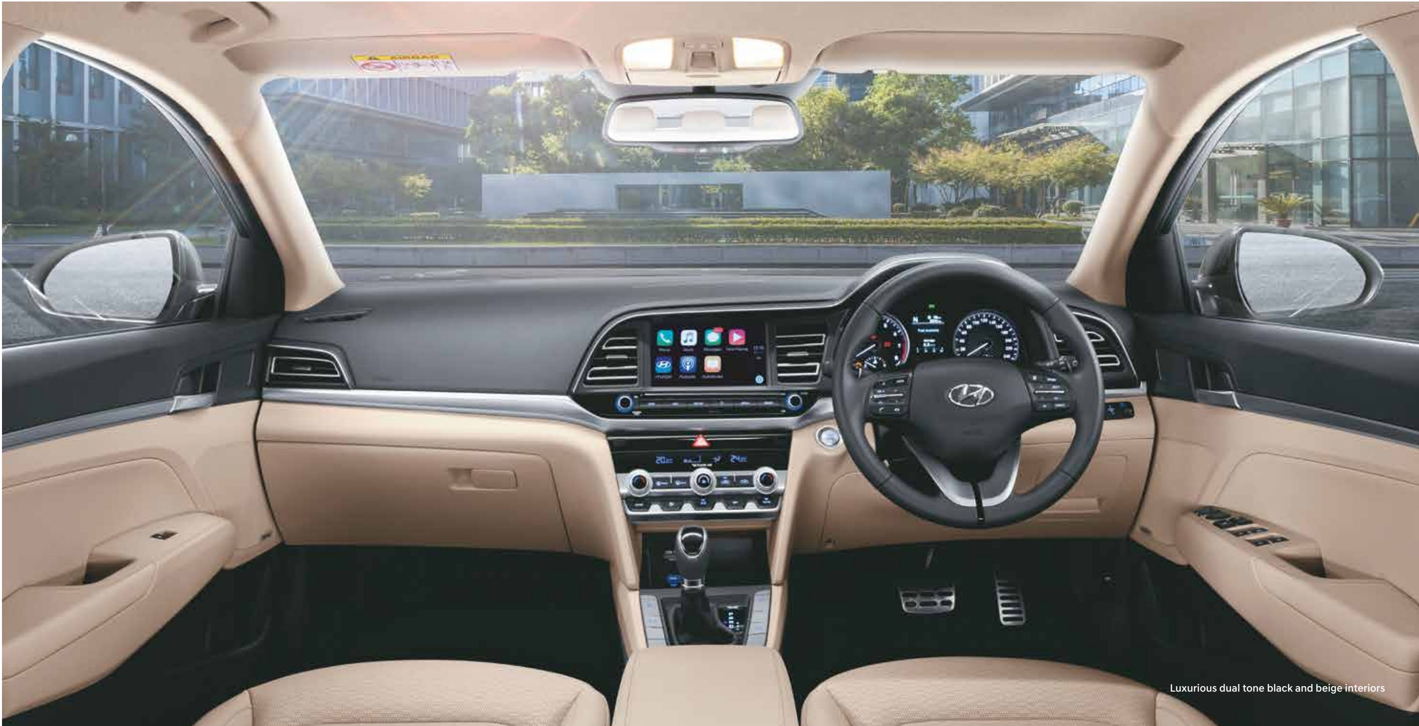
Luxurious dual tone black and beige interiors