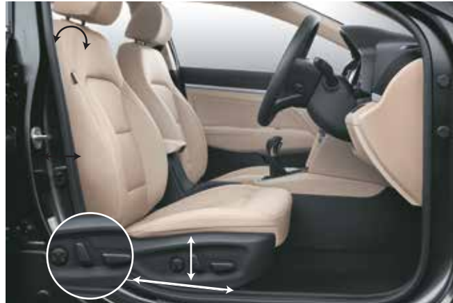
10 way adjustable power driver seat with electric lumbar support

Other features: Sporty aluminium pedals | Driver-centric ergonomic design Rear centre armrest with cup holder | Rear defogger | Premium aluminium scuff plates Sliding front centre armrest with storage