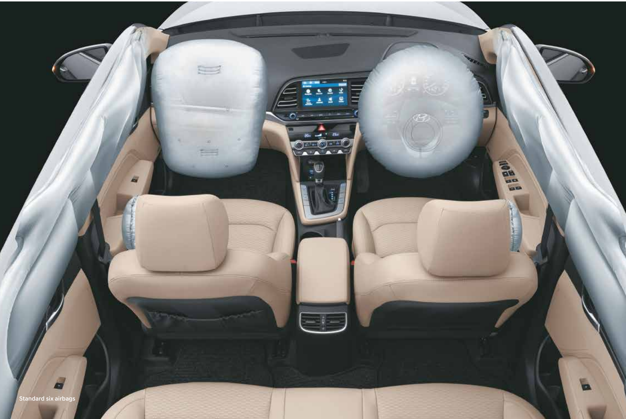
Standard six airbags