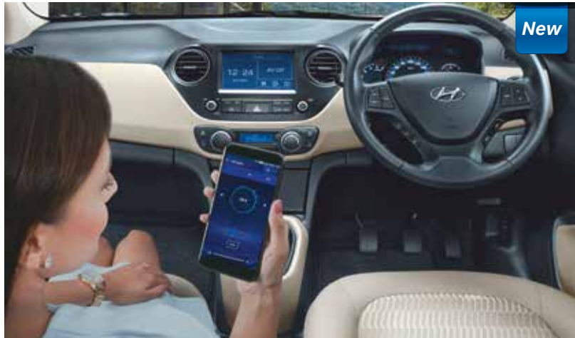
Hyundai iBlue Smart Phone App for Audio Remote Control*

A class-leading 17.64 cm Touch Screen Audio Video System with smart phone connectivity, voice recognition and navigation support, gives the XCENT an advanced hi-tech imagery.