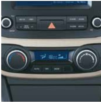
Fully Automatic Temperature Control