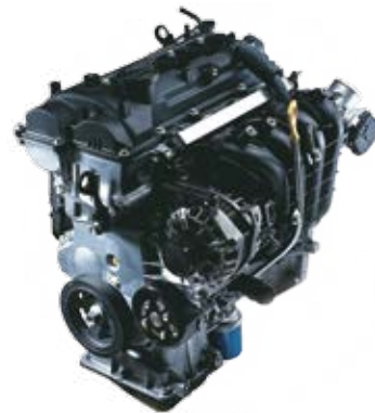
1.2L Kappa Dual VTVT Petrol Engine