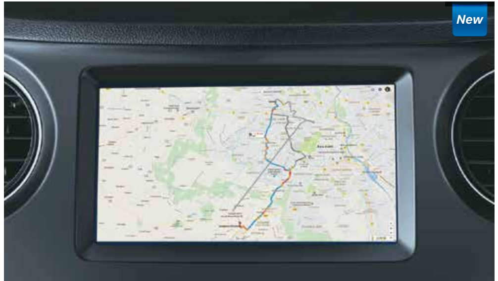
17.64 cm Touchscreen Audio Video System | MirrorLink | Smart Phone Navigation