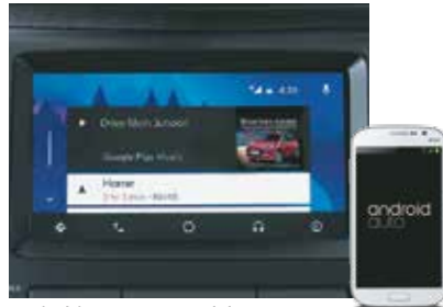
Android Auto Connectivity