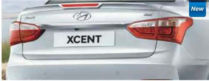
New Sporty Boot Lid Spoiler and Premium 2-Piece Wraparound Tail Lamps