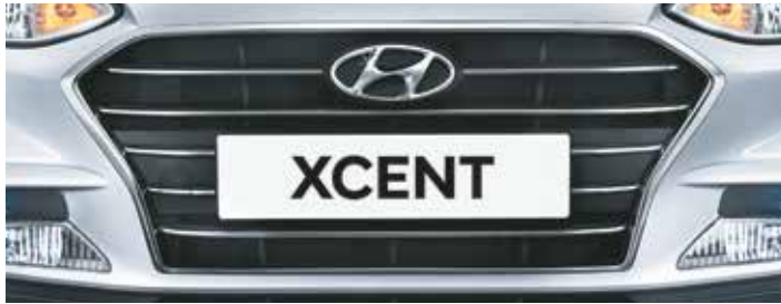
Hyundai Signature Cascade Design Grille with Chrome Slats

Rear Chrome Garnish | Electric Folding ORVM with Turn Indicator