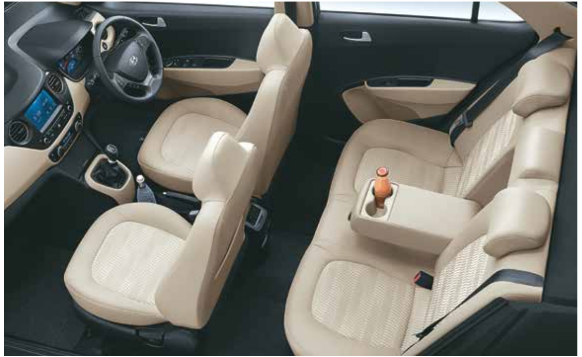
Bright and Spacious Interiors with New Seat Upholstery