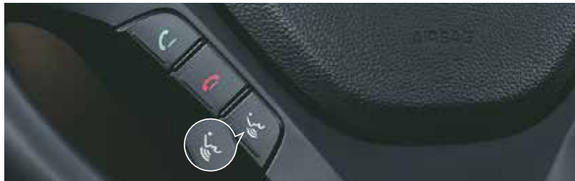
Voice Recognition Button on Steering