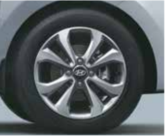
R15 Diamond Cut Alloy Wheels