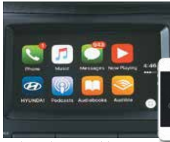
Apple CarPlay Connectivity