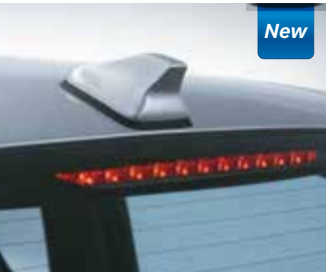
Shark Fin Antenna