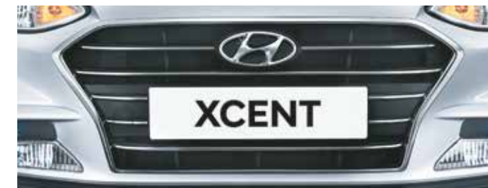
Hyundai Signature Cascade Design Grille with Chrome Slats

Rear Chrome Garnish | Electric Folding ORVM with Turn Indicator