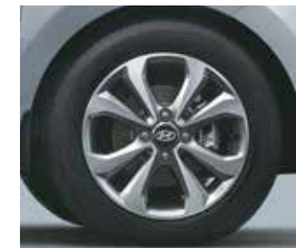
R15 Diamond Cut Alloy Wheels