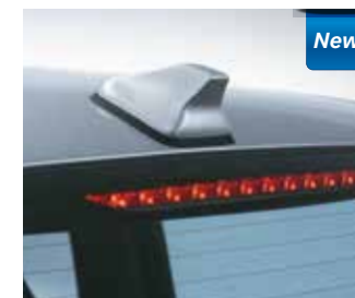
Shark Fin Antenna