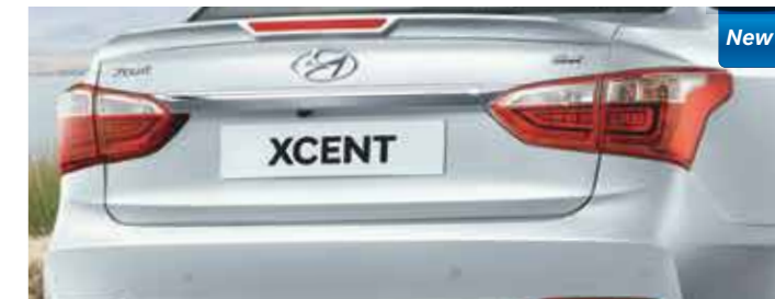
New Sporty Boot Lid Spoiler and Premium 2-Piece Wraparound Tail Lamps