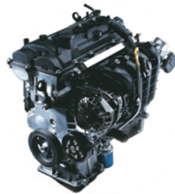
1.2l Kappa Dual VTVT Petrol Engine