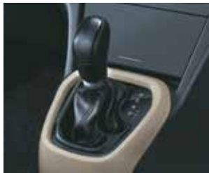
4-speed Automatic Transmission