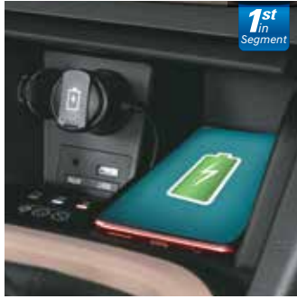
Wireless Phone Charger