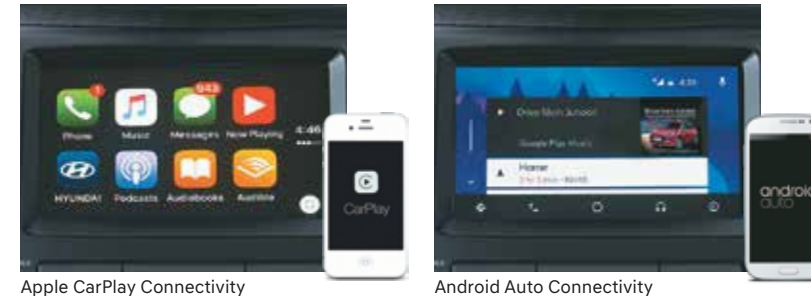
Apple CarPlay Connectivity