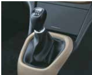
5-speed Manual Transmission

Whether you are negotiating the rush hour in the city or cruising on the highway with your family, the XCENT performs to perfection. With state-of-the-art petrol and diesel engines, it is highly responsive and very efficient.