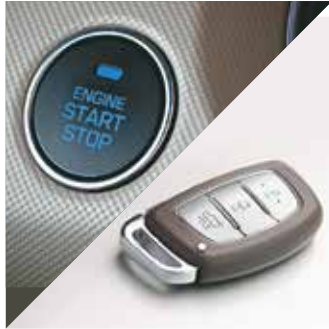
Smart Key with Push Button Start-Stop