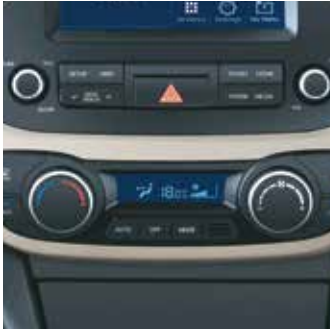
Fully Automatic Temperature Control