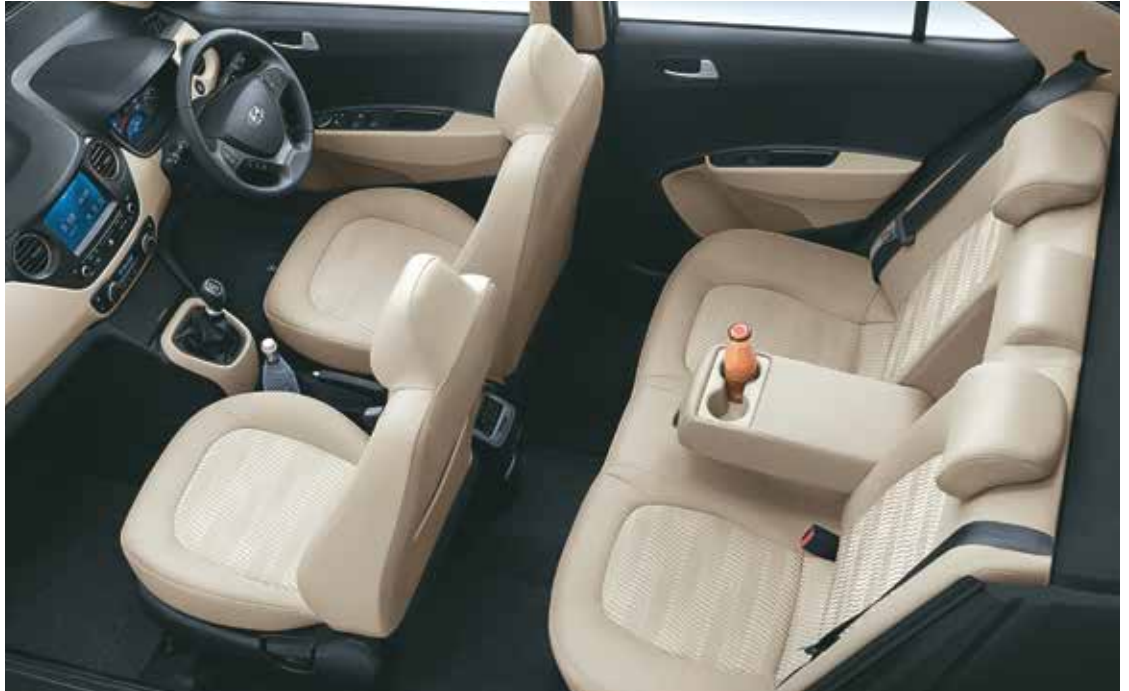
Bright and Spacious Interiors with New Seat Upholstery