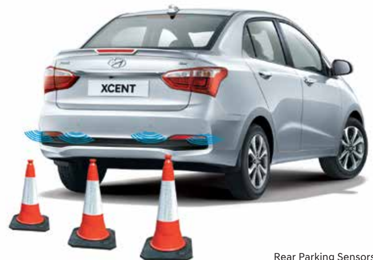
Rear Parking Sensors