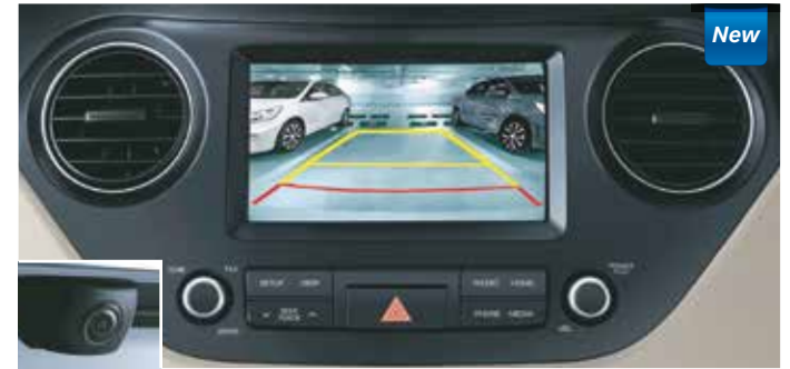
Rear Parking Assist System (with Display on 17.64cm Audio Screen)