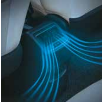
Rear AC Vent & Accessory Socket