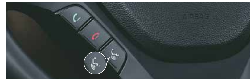
Voice Recognition Button on Steering