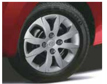
Full Wheel Cover