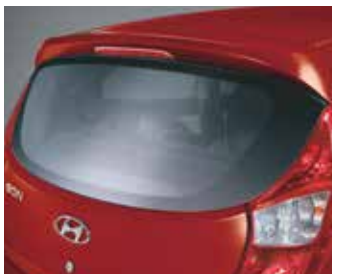
Integrated Spoiler with HMSL