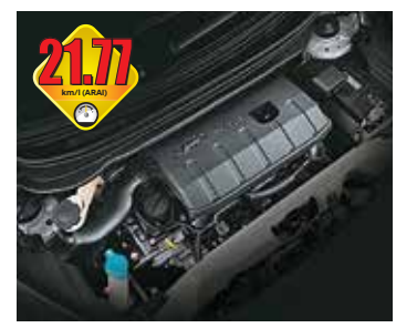
0.8L iRDE Engine