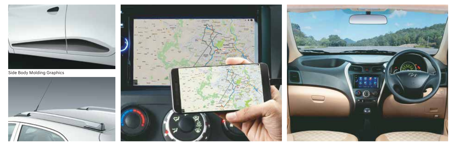
Sporty Roof Rails