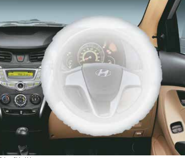
Driver Side Airbag

The Hyundai EON offers convenience beyond compare with ergonomically designed utility features and ample storage space. The interiors, an amalgamation of breathtaking design and function, make the Hyundai EON a statement like none other.