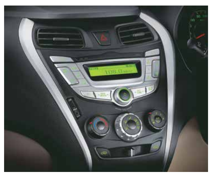
AC & 2 DIN Audio with AUX-in & USB Ports