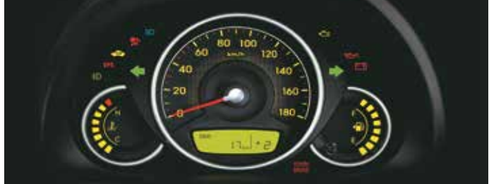
Instrument Panel with Gear Shift Indicator