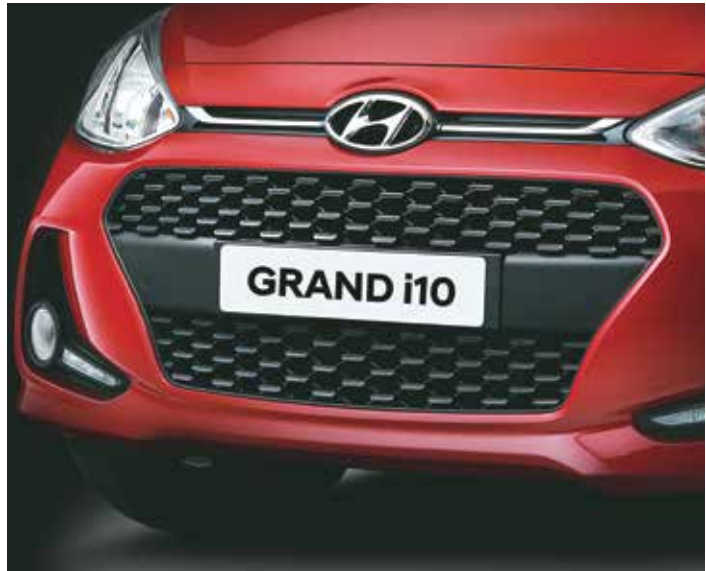
Cascade Design Grille - Bold New Design Identity