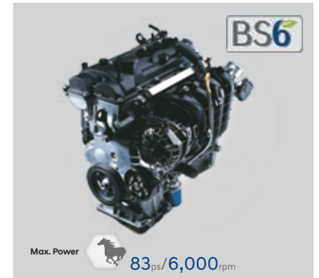
1.2L Kappa Dual VTVT Petrol Engine