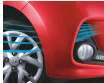
Front Air Curtains