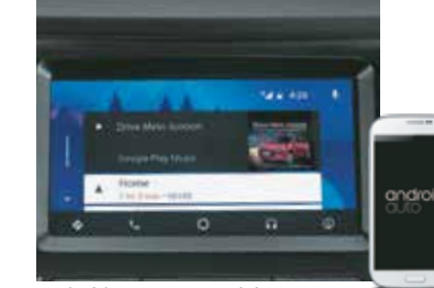
Android Auto Connectivity