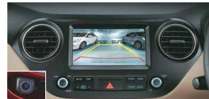
Rear Parking Camera (with display on 17.64 cm Audio Screen)