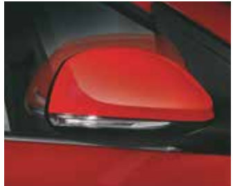
Electric Folding ORVM with Turn Indicators