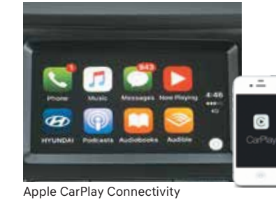
Apple CarPlay Connectivity