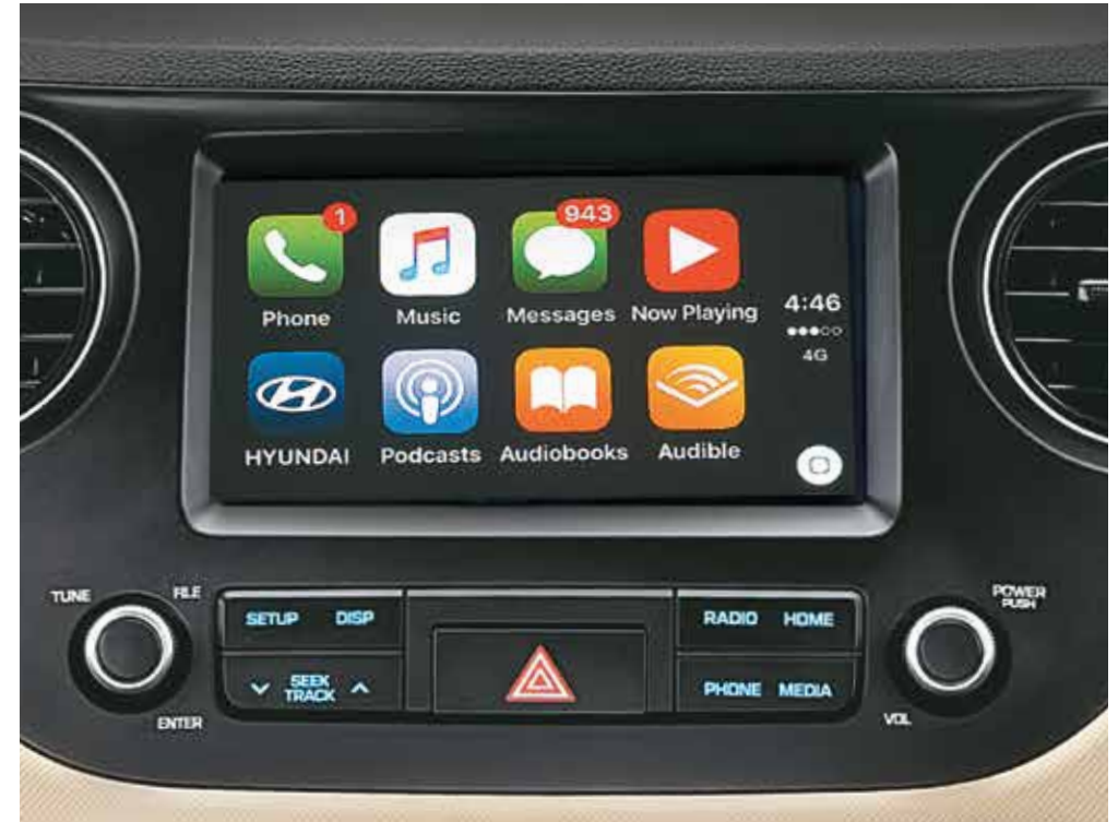
17.64 cm Touch Screen Audio Video System with smartphone connectivity*

The GRAND i10 offers assistive technology at its very best with a class-leading 17.64 cm Touch Screen Audio Video System with smartphone connectivity, voice recognition and navigation support.