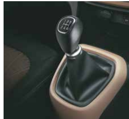
5-speed Manual Transmission

Experience power like never before with the state-of-the-art petrol engine of the GRAND i10.