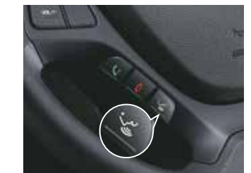
Voice Recognition Button on Steering