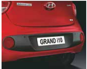
Dual Tone Rear Bumper