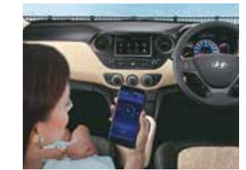
Hyundai iBlue Smart Phone App for Audio Remote Control*