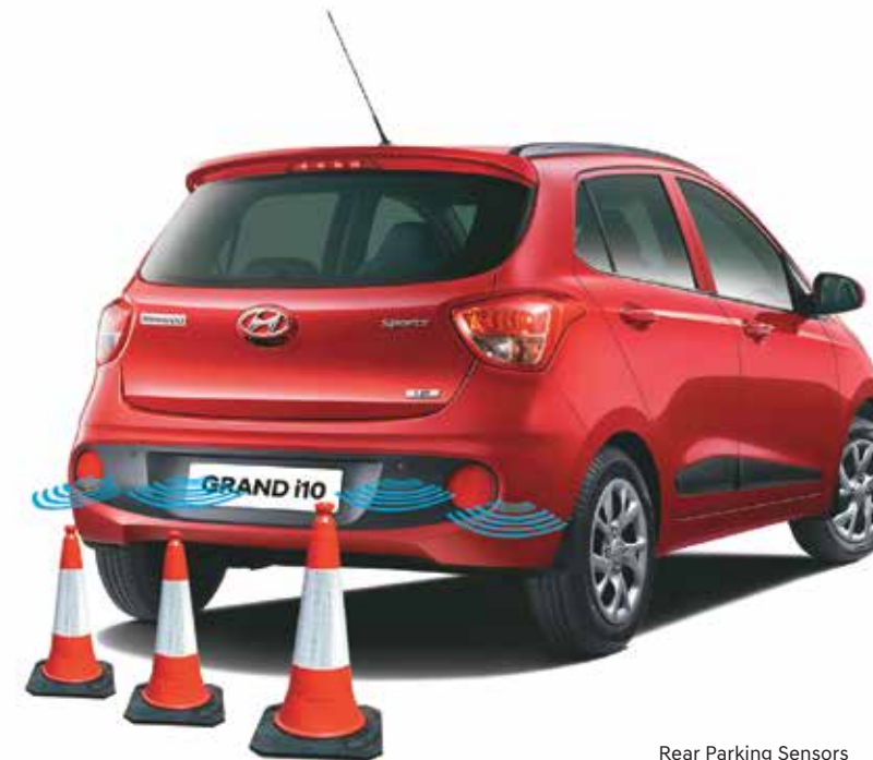
Rear Parking Sensors