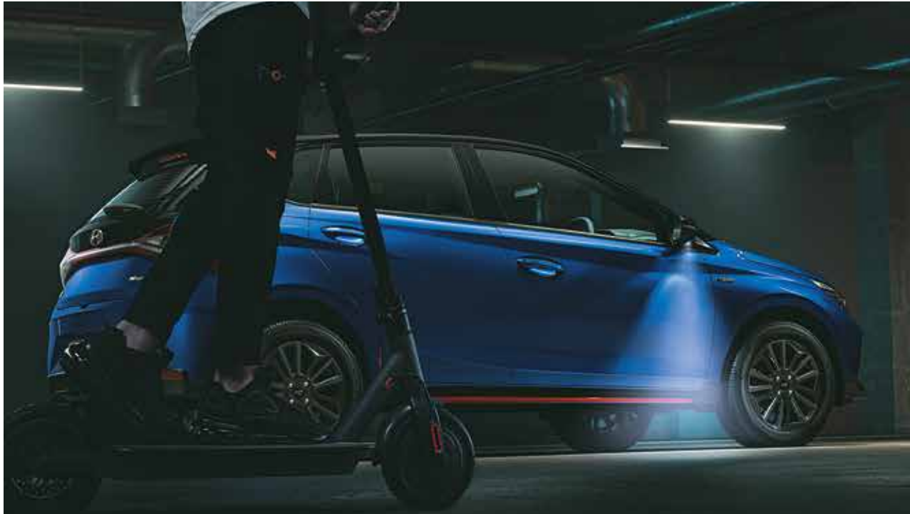
Puddle lamps with welcome function