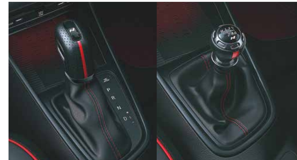
Perforated leather* wrapped gear knob with N logo (7 DCT & iMT)