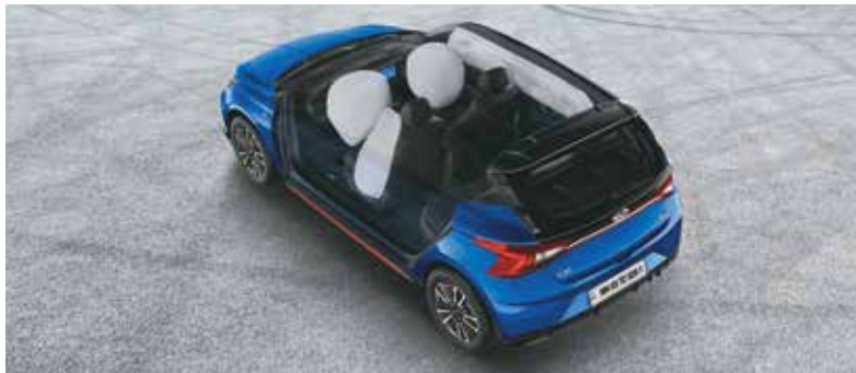
Driver, passenger, side & curtain airbags