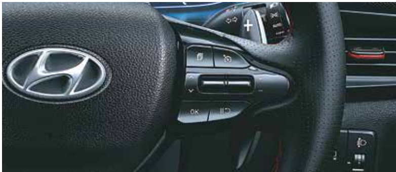
Paddle shifters (DCT only)