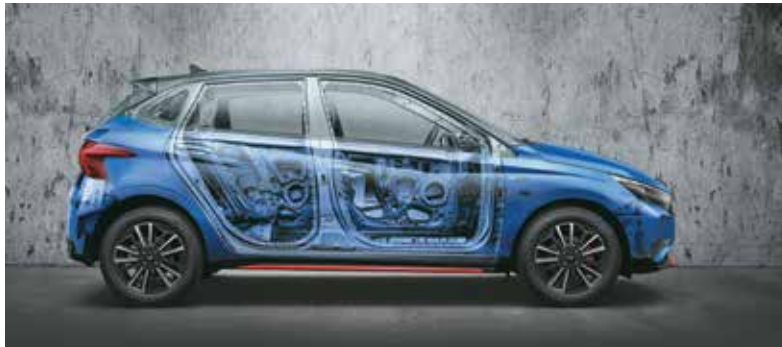
Strong body structure with AHSS & HSS