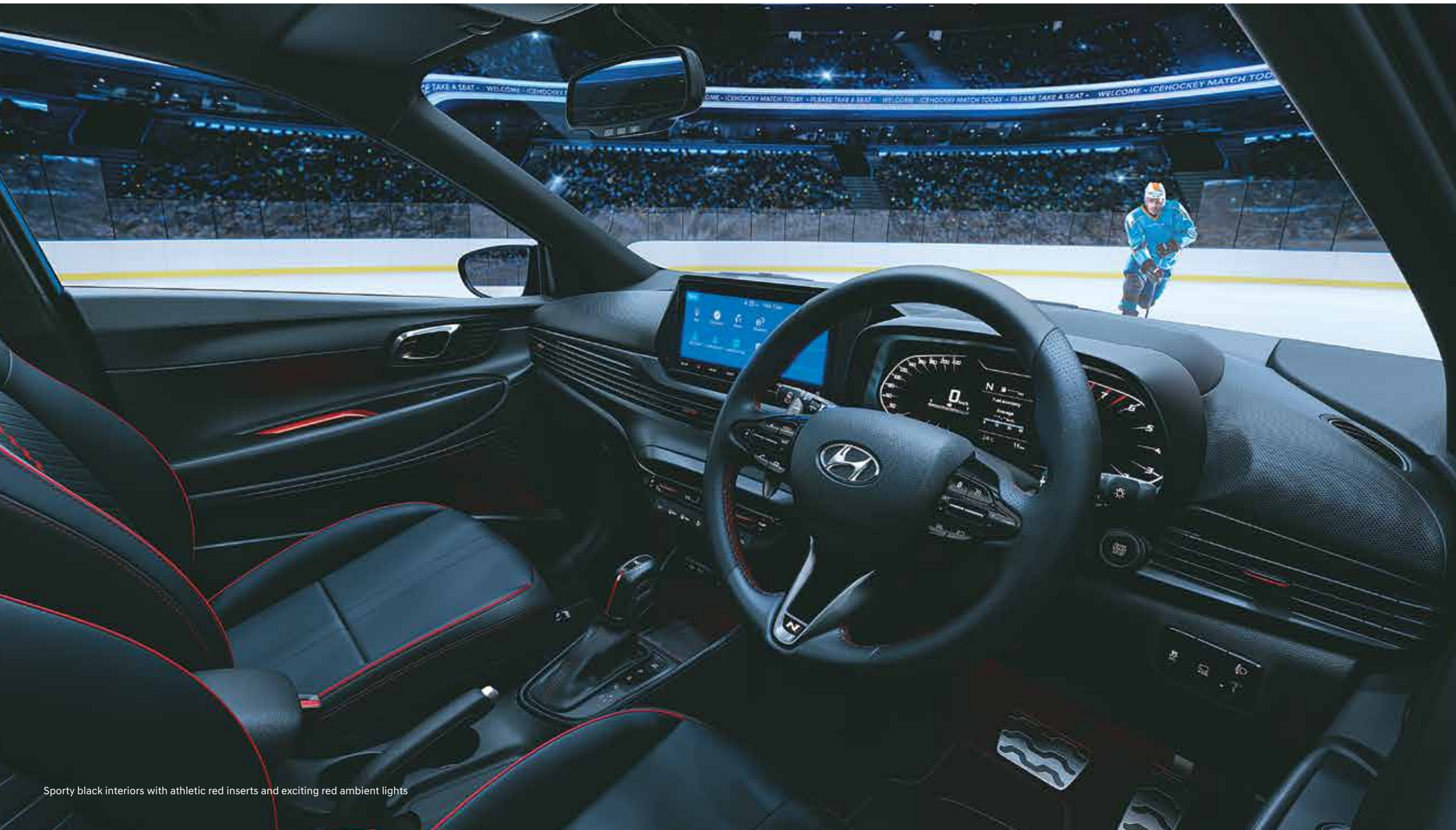
Sporty black interiors with athletic red inserts and exciting red ambient lights