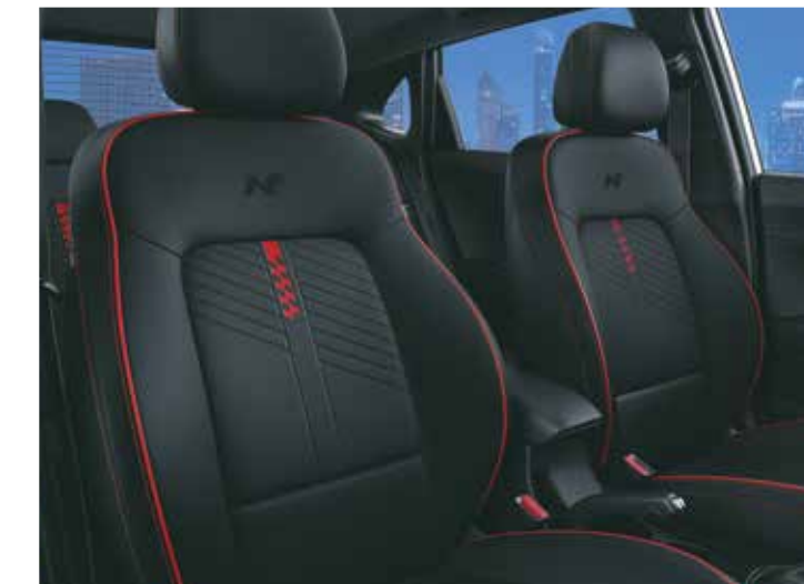
Chequered flag design leather* seats with N logo