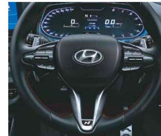
3-spoke steering wheel with N logo

With Over-the-Air (OTA) map updates# 3 years free Bluelink subscription