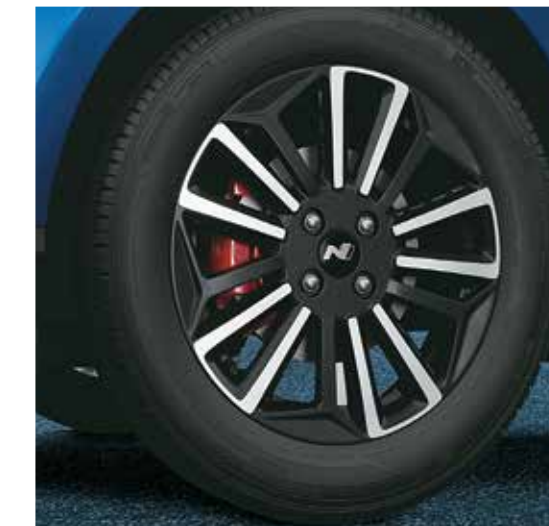
R16 (D=405.6mm) diamond cut alloy wheels with N logo and front disc brakes with red caliper