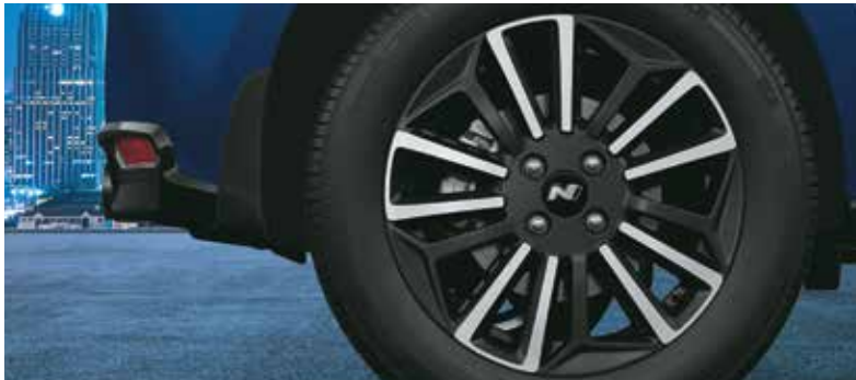
Rear disc brakes