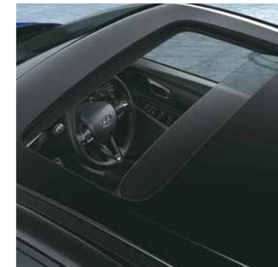
Voice enabled smart electric sunroof