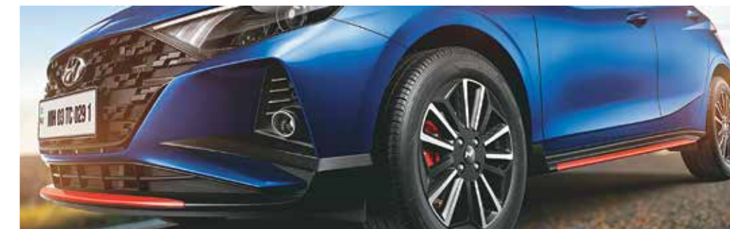
Athletic red highlights* (front skid plate & side sill garnish)

Sporty and breathtakingly stunning, the Hyundai i20 N Line commands attention everywhere it goes with its WRC inspired sporty new design. Its exciting new athletic design and playful details set you apart from the crowd in a field of lookalikes.