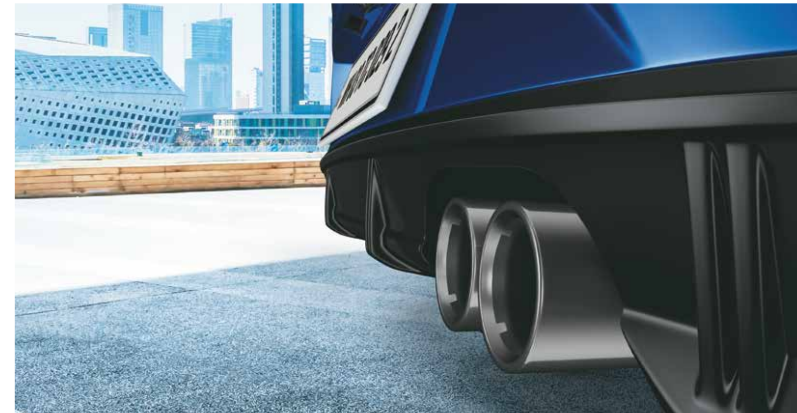
Twin tip muffler