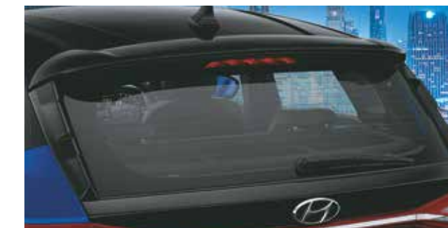
Sporty tailgate spoiler with side wings

Other features – LED projector headlamps with LED day time running lamps (DRL) | Dark chrome connecting tail lamp garnish Front fog lamp chrome garnish