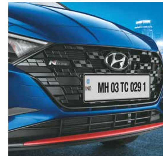
Chequered flag inspired front grille

Images are for creative purposes only. Please do not imitate. Hyundai encourages safe driving practices.