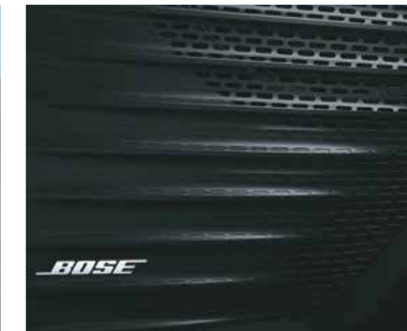
Bose premium 7 speaker system

Other features – Wireless charger with cooling pad | Digital cluster with TFT multi information display (MID)