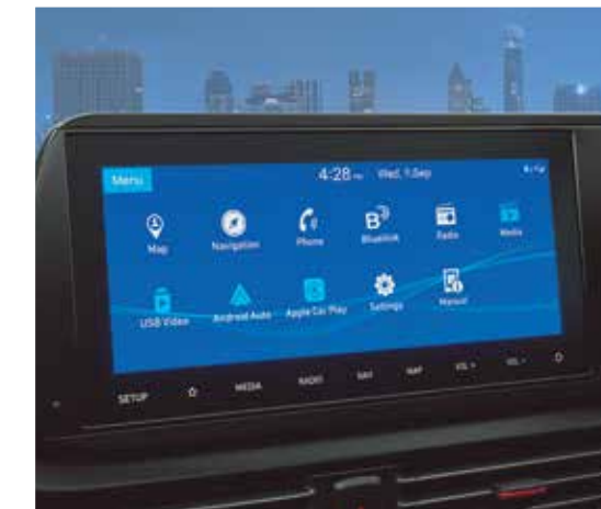
26.03 cm (10.25") HD touchscreen infotainment & navigation system