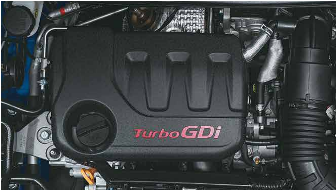
1.0 I Turbo GDi petrol engine with max. power of 88.3 kW (120 PS) / 6 000 r/min