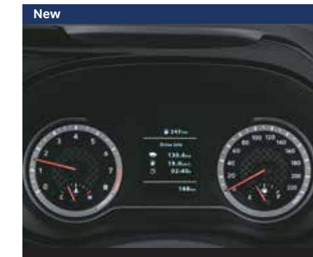
8.89 cm (3.5") Speedometer with multi information display