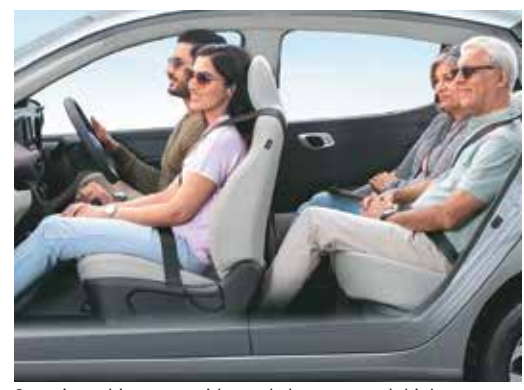
Superior cabin space with ample legroom and thigh support