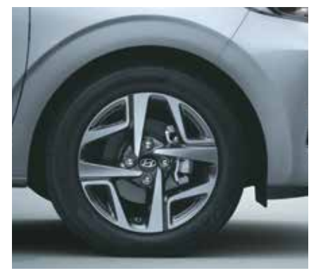
R15 (D = 380.2 mm) Diamond cut alloy wheels