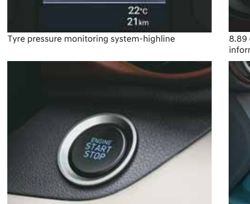
Smart key with push button start/stop