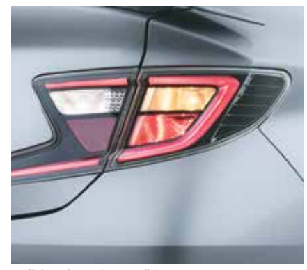
Stylish Z shaped LED tail lamps