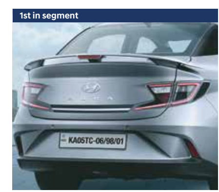
Rear wing spoiler