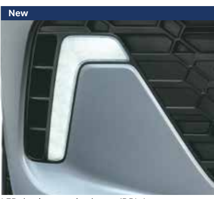
LED daytime running lamps (DRLs)