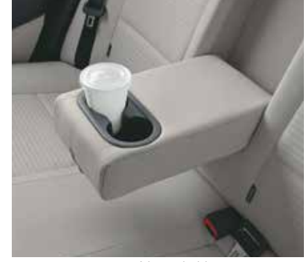
Rear centre armrest with cup holder