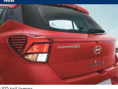
LED tail lamps