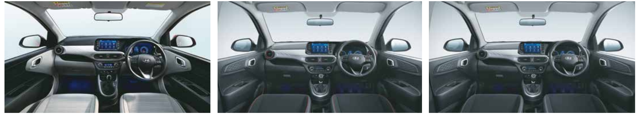
Dual tone grey interior