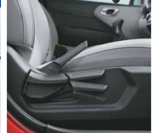
Driver seat height adjuster