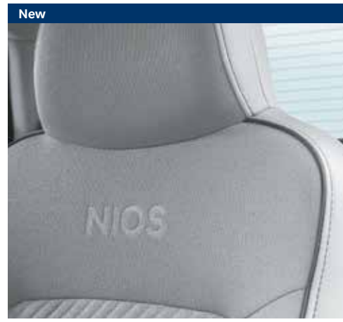
Semi fabric seat with piping