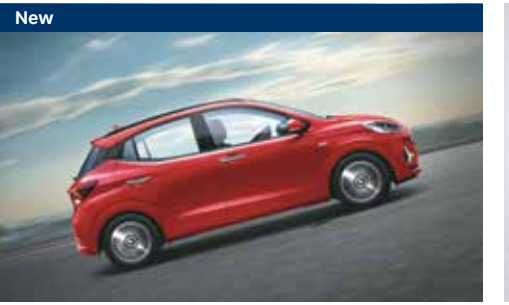
Hill-start assist control (HAC)