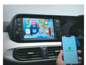
Apple CarPlay and Android Auto