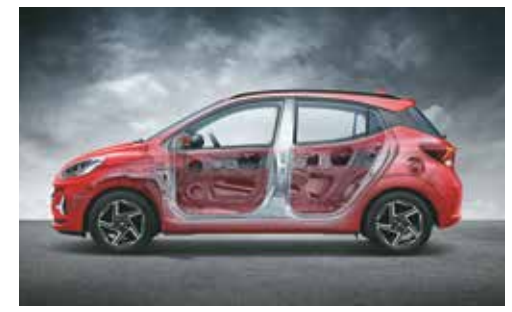
Strong built structure

Other features: Child seat anchor (ISOFIX) (New) | Driver rear view monitor (DRVM) (Best in segment) | Speed alert system | Front seatbelt pretensioner with load limiters | Burglar alarm (New) | Rear defogger | Impact sensing auto door unlock | Speed sensing auto door lock | Headlamp escort system Emergency stop signal (1<sup>st</sup> in segment)