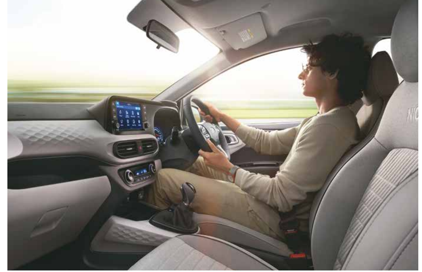
Dual tone grey interior