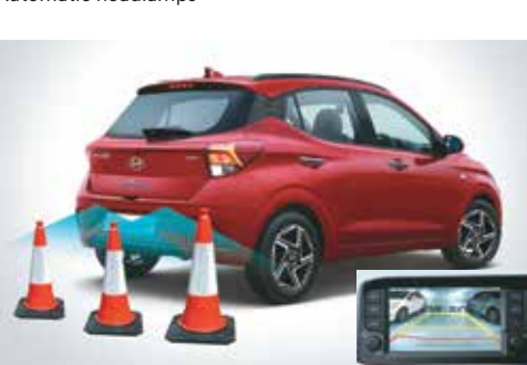
Rear parking camera with display on audio