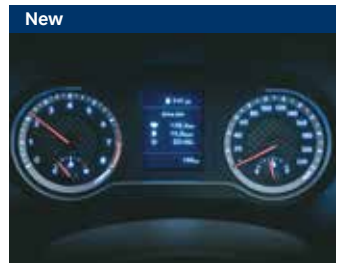
8.89 cm (3.5") speedometer with multi info display